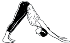
(5) Parvatasana (Mountain pose)