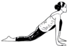
(4) Ashwa Sanchalan Asana (Lunge pose)