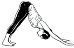
(8) Parvatasana (Mountain pose)