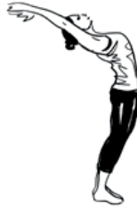
(2) Hasta Uttanasana (Raised arms pose)