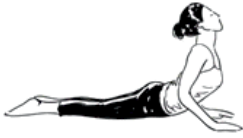
(7) Bhujangasana (Cobra pose)