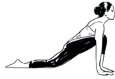
(9) Ashwa Sanchalan Asana (Lunge pose)