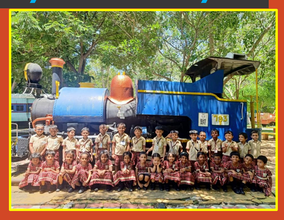
Education Trip – ICF Museum