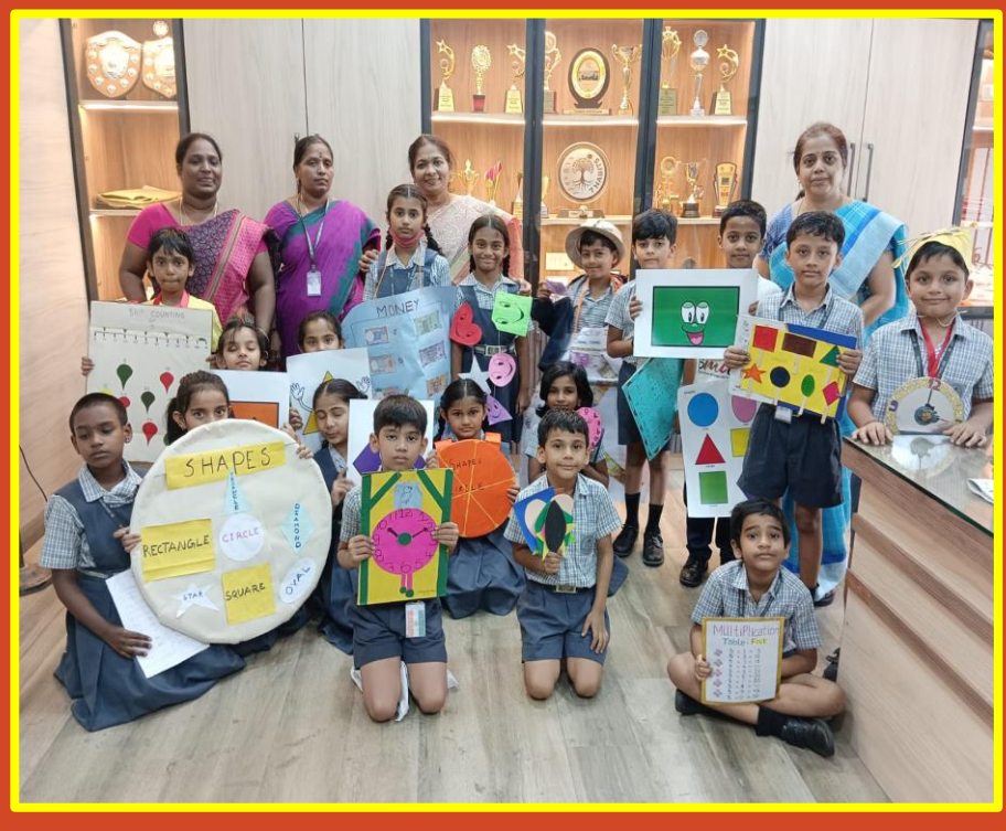
Prosody of Mathematics