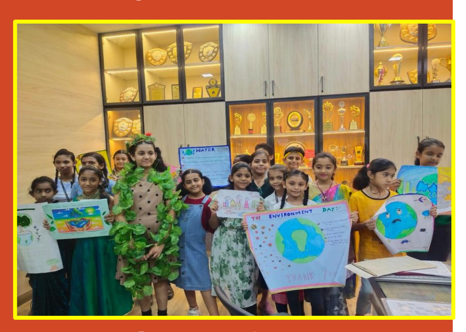
Save the Environment